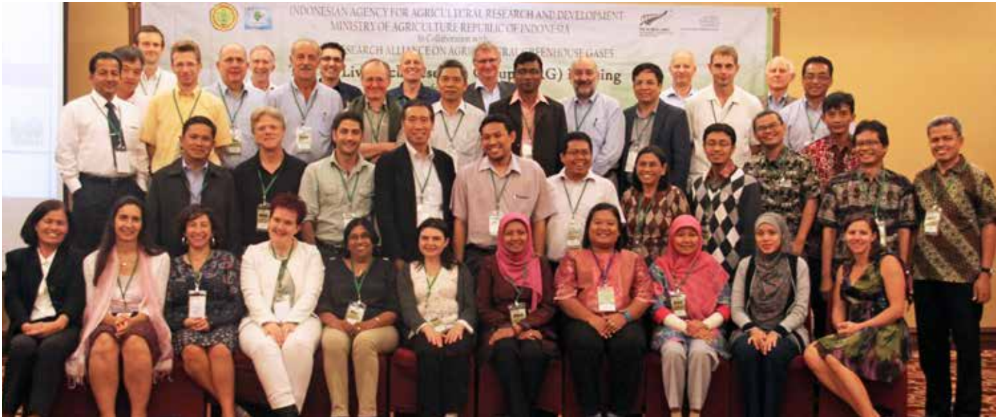
The LRG meeting 2014 at Jogyakarta Plaza Hotel, Jogyakarta, Indonesia, 14-15 November 2014.